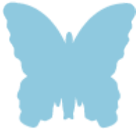
Azure (Light Blue)