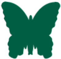
Pine (Dark Green)

*includes shipping on a minimum 120 gallon order