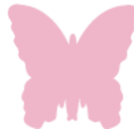
Wild Rose (Pink)