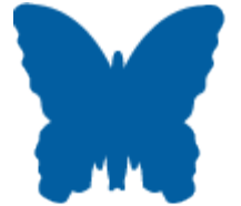
Blueberry (Dark Blue)

18.9 Litre - $41.30 10 Litre - $22.95 3.78 Litre - $10.45