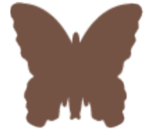
Chestnut (Dark Brown)