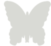
Winter Solstice (Light Grey)