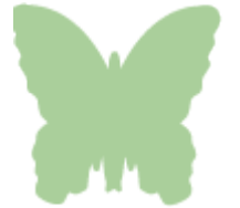
Meadow (Light Green)