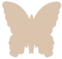
Birch Bark (Light Brown)