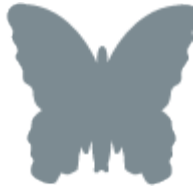
Thunderhead (Dark Grey)